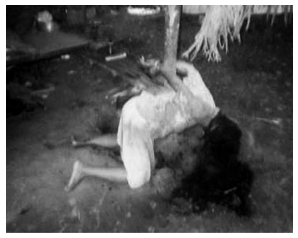
Figure 5: Salvaging Victim, General Nakar, Quezon Province, April 2006<sup>10</sup>

Consider also the military practice of salvaging people (Figure 5). The term "salvaging" derives from the Tagalog word salbahe , meaning "wild" or "savage," and this comes from the Spanish word salvaje , meaning "barbarous" (McCoy, 2009). When someone is salvaged they are abused before being killed, and their mutilated body is disposed in public as a warning to others (McCoy, 2009).