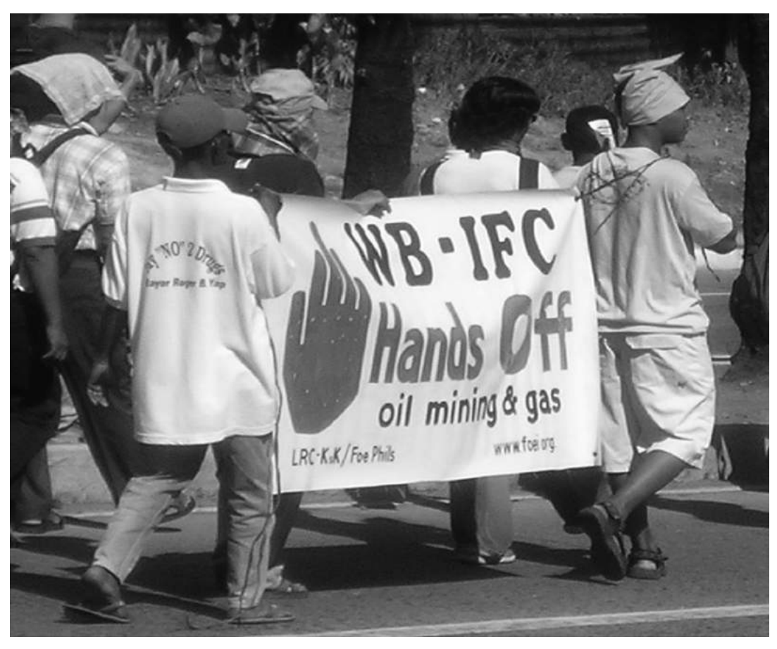
Figure 3: Anti-Mining Mobilization, Metro Manila, April 2005

the workers (Delgado, 2007). If the multinational corporations operating agribusiness plantations are not behind these killings, they at least benefit from them by receiving a union free workforce (Delgado, 2007). In the export processing zones of Luzon and Cebu, union organizers are frequently killed; as Legaspi (2007, 107) wrote, "Union formation has become an activity as difficult as a [water buffalo] passing through the eye of a needle." Santos Mero indicated that opposition to mining is viewed as a "front" for the NPA and many leaders of antimining groups are threatened by the AFP; if one opposes development activities, one is viewed as an enemy of the state (Mero, 2007). Jun Saturay was a former member of the Alliance against Mining in Oriental Mindoro (and the former Provincial Chair of Bayan Muna) before seeking refugee status in the Netherlands. According to Saturay, a large percentage of extrajudicial killings occur in areas where development projects are located (Saturay, 2007). Many of the victims are activists from community organizations opposing these projects and the government has reverted to a policy of "elimination by assassination" (Saturay, 2007). Multinational corporations deny having anything to do with the killings of activists who oppose their projects, but still benefit from having the AFP do it for