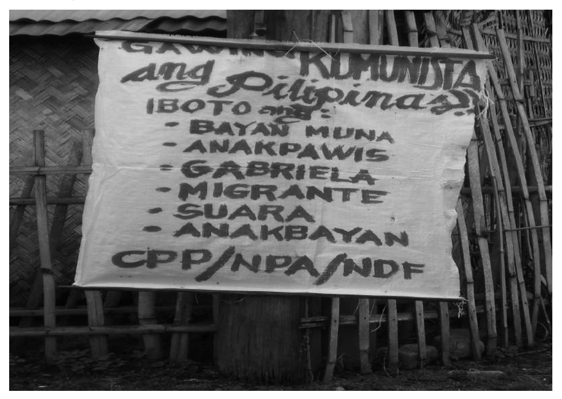
Figure 4: AFP Black Propaganda Poster, General Santos City, April 2007 ("If you want the Philippines to become communist vote for: Bayan Muna, Anakpawis, Gabriela, Migrante, Suara, Anakbayan")

are given an opportunity to tell others that they have been targeted. When they are killed their death sends a message to others that such threats possess veracity and they may be next; in this context, terror "becomes a communicative strategy that aims beyond the killings themselves to send a message to the survivors" (Oslender, 2007, 121).