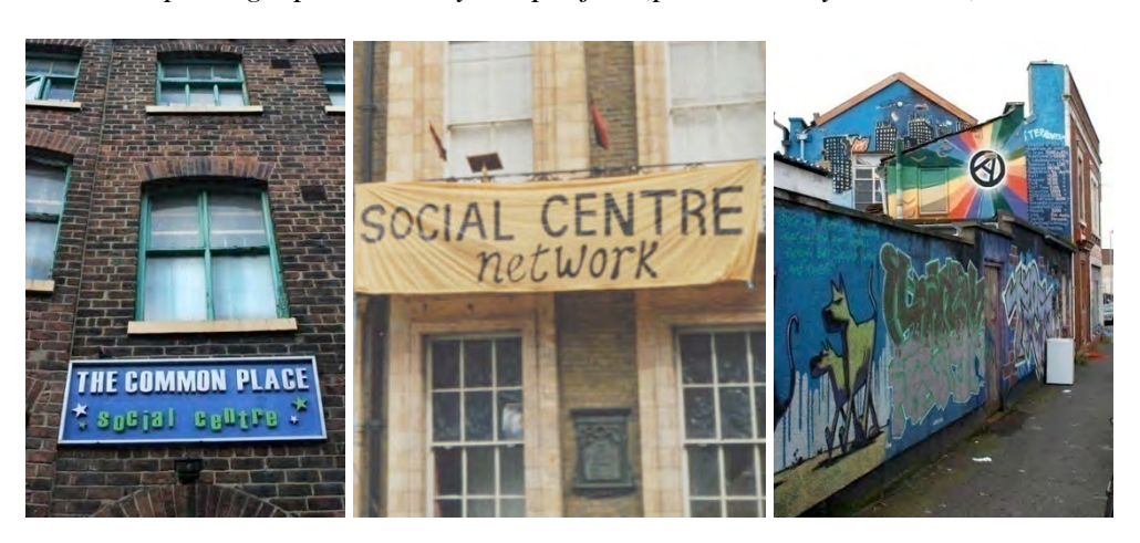
Figure 1: Left to right: The Common Place Social Centre, Leeds – the location of the first gathering for social centre projects, 'Social Centres Network' banner at Russell Square squat, London, and Kebele Social Centre, Bristol – which hosted an exhibition of social centre photographs taken by the project

Despite our concerns, we began to plan what else we could contribute to this developing movement. Early on, we were aware of numerous previous studies on squats and social centres and one task we undertook was to produce a reader compiling these and give one to each social centre. As part of our ongoing interest in social centres, we visited about a dozen of them, relatively informally,