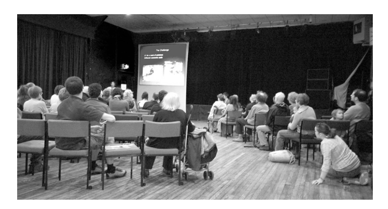
Figure 2: Public launch of Lammas, Narbeth, Pembrokeshire, 6<sup>th</sup> May 2006.

Our collaboration began in February 2006 with a two day visit to Swansea where the group was based. The core group was small, voluntary, under resourced, and had multiple needs. We quickly negotiated full access to Lammas in return for playing a supporting role to their aspirations, although in practice we had little understanding of what Lammas was or how it worked, and they had little understanding of our project's resources or capacities. We had joined Lammas just six months after its launch, and the group was moving at a fast pace (Figure 2). They had just found a potential plot of land which created an added sense of urgency and their needs quickly outweighed both our capacity and purpose (see Figure 3). As choices of meeting dates and timeframes were necessarily set by the group, there were inevitable clashes of commitments, personal dilemmas, and lots time spent travelling to and fro.