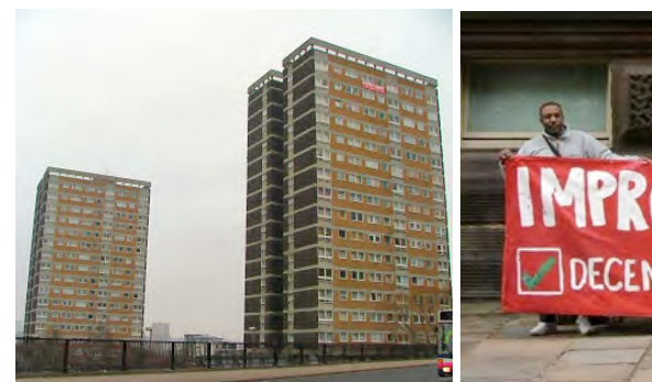
Figure 4: The Little London estate, Leeds, and one of the many campaign banners

Events rapidly snowballed. We started to attend and minute meetings of the Save Little London Campaign in the local pub, helped to organise a public lobby of the Council, arranged banner-making sessions, held an alternative consultation of tenants as the Council undertook theirs, hosted public meetings and got good media coverage through writing press releases and using our contacts (see Figure 4). We also set up a blog-style website (www.savelittlelondon.org.uk).