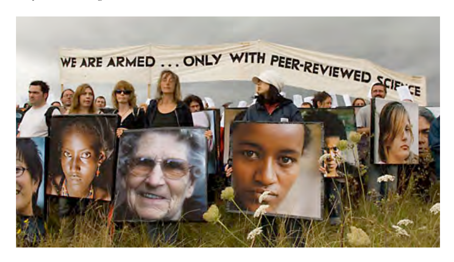
Figure 5: Activists using academics at the Climate Camp

Further, at times, critical distance can be a useful tool which can be used to help groups we work with challenge particular readings of events or shortcomings of tactics. This articulation of contentious perspectives is difficult in action-research,