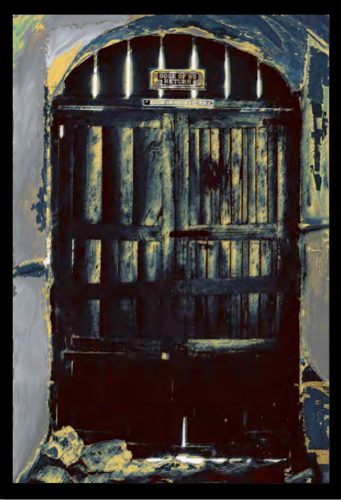
Figure 1 The Castle in Cape Coast, Ghana