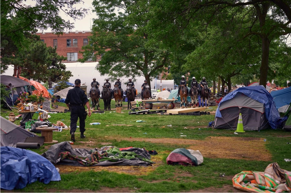
Figure 2: Encampment Eviction at Lamport Stadium, July 21, 2021.