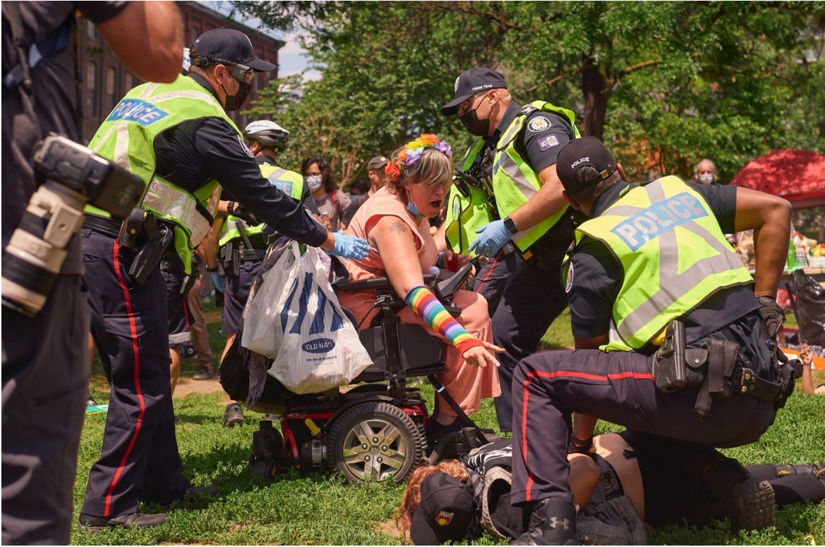
Figure 5: Encampment Eviction at Lamport Stadium, July 21, 2021.

to those who work it" (Tuck and Yang 2012, 30), which historically legitimated the colonial theft and seizure of Land.