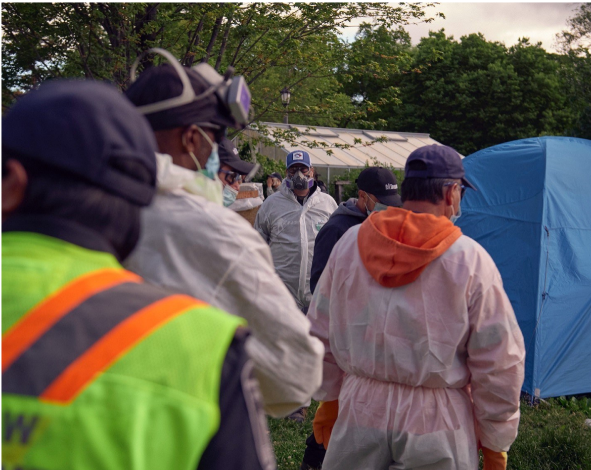
Figure 6: Encampment Eviction at Trinity Bellwoods Park, June 22, 2021.

deemed a public health hazard. Subsequently, the Creek was buried beneath a ten-foot diameter Victorian brick sewer. The refractory ravine provided a continuous network of urban green space even as development continued in the immediate area—residential properties, gravel quarries, and a brickyard in the Bickford Vale (which the Creek previously ran through) were all erected. The area was eventually deemed inadequate for further development and was quickly devalued, and once again, served as an inexpensive landfill for garbage and debris. By 1883, water pollution was recognized as a significant threat to health, and Toronto appointed the first permanent and salaried Medical Health Officer, Dr. William Canniff. Canniff was particularly tasked to address the heightened risk of infectious disease (i.e., smallpox, typhoid fever, diphtheria) from inadequate drainage, untreated sewage, and the polluted waterway, which, as he commented in an annual report, “has been converted into what is little better than a cesspool” (as cited by MacDougall 1981, 195). As a “highly uncooperative commodity” (Loftus 2009) the waterway was once again buried and the area viable for development was sold. The area ineligible for development was relegated for park space—most of which is now known as Trinity Bellwoods Park.