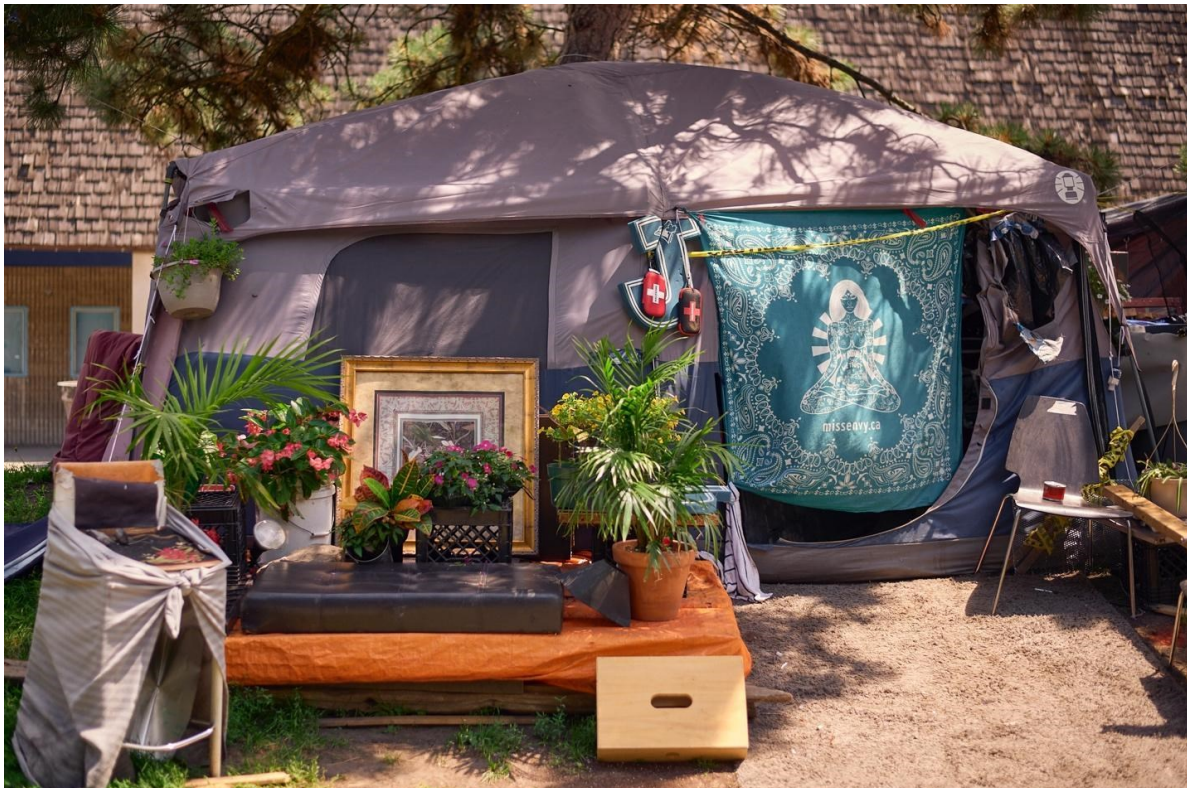
Figure 1: Shelter in Place, Housed Neighbour in Trinity Bellwoods Park, June 2021.