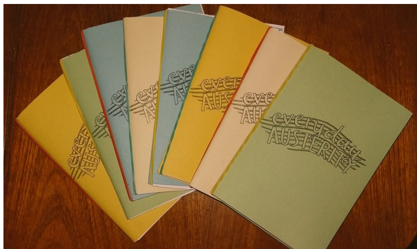
Figure 2. Copies of the Everyday Austerity zine