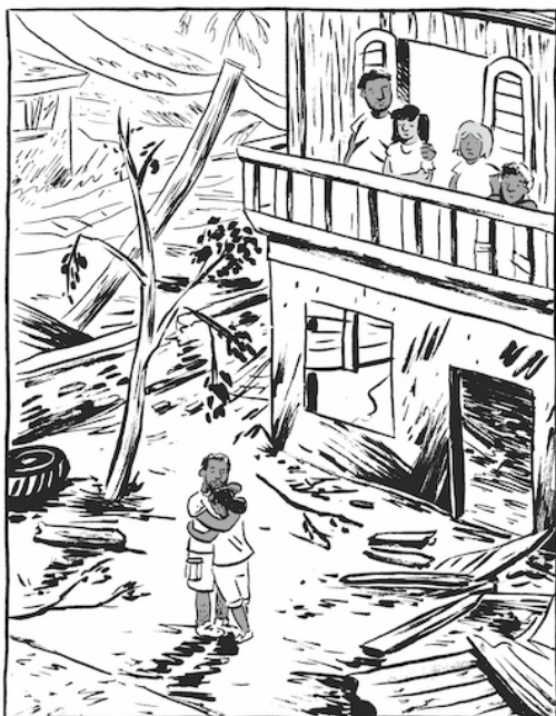
Figure 4. After Maria comic

Similarly, in Everyday Austerity , the story of Sharon and Bill offers an insight into everyday ways of getting by during hardship and personal crises. The example in Figure 5 below illustrates how their Saturday morning routines help them to keep going, made up of simple pleasures-making a cooked breakfast, going to local shops, petting dogs and feeding horses, having a walk, a tipple of beer, and doing the crossword-that they look forward to. Accompanied by a short excerpt or vignette – as a means of rich yet specific story-telling – the imagery of the two participants displays a physical sense of ease and togetherness. This is portrayed by their close corporeality, relaxed posture and eyes both on the crossword puzzle as a shared, enjoyable activity. Furthermore, the choice of typeface is an important one, again selected in dialogue with Claire. Given that the excerpts were often taken from field diaries, sometimes verbatim, and that the zine tells very personal stories of living with austerity, it was agreed that the typeface needed to convey this. Claire suggested using one that she had designed from her own handwriting, to give a sense of a handwritten note or diary entry.