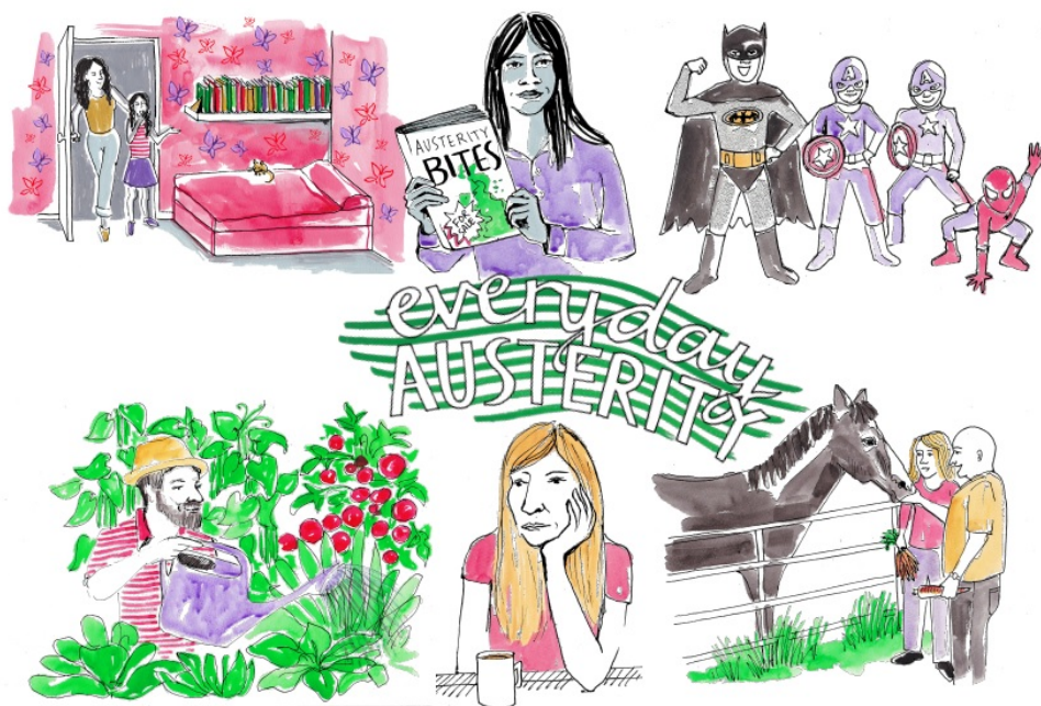
Figure 3. The central image of the Everyday Austerity zine, when folded out

Furthermore, comics and zines have their own vocabulary: gutters, panels, tiers, balloons, bubbles, bleeds, splashes, perspectives, shading, folds, pleats and so forth. These are all elements that carry meaning and which exist meaningfully in relation to one another in the space on the page. Contemporary comics and zines ask us to reconsider several dominant commonplaces about images, including that visuality stands for a second-tier literacy. Notwithstanding, comics and zines involve a substantial degree of reader participation to decode narrative meaning and sometimes subtle imagery. And the visual content of comics and zines that once signaled a "lesser-than" literacy is now an integral part of contemporary daily lives. Primary media intake, especially online, combines the verbal and the visual and often with complexity people learn to navigate quickly (Hattwig et al 2013).