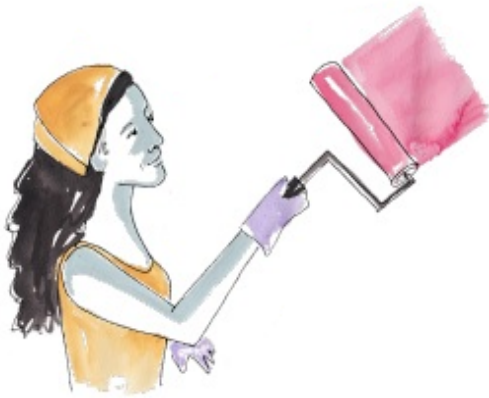
Figure 8. Depicting race: Selma in the Everyday Austerity zine

However, we were careful not to romanticise families' 'resilience', and place too much emphasis on capacities at the household level. Overly focusing on the capabilities of families as the analytical explanation for impacts and recovery from societal hazards moves responsibility for risk towards affected populations, whilst the broader political, economic, social, and environmental structures that shape family resilience are obscured and left unexplored. One of the ways we did this was to ensure that any details about the research and findings are kept slimmed down, placing the focus instead on the stories as placed together, rather than our own academic interpretations. In the Everyday Austerity zine the inside sleeve of the card cover contained a very short introduction and similarly in After Maria there was a very brief introduction, plus 6 pages with information about 'Disasters around the world'.