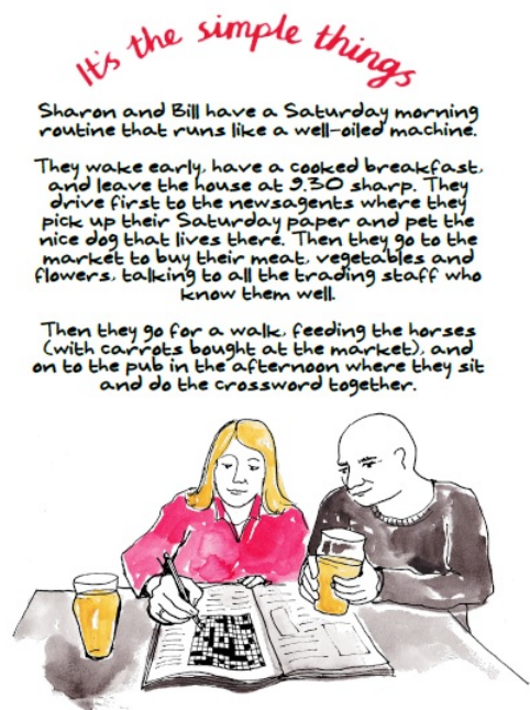
Figure 5. 'It's the simple things', from the Everyday Austerity zine

Visual storytelling also allows researchers to be economical with text in a way that maintains the complexity of findings (Aiello and Parry 2019). A researcher may need 500 words to communicate an idea that can be communicated in a few images, with limited dialogue (Public Anthropologists 2020). Therefore, it is critical to collaborate with an experienced artist who is sensitive to the research findings and also has the skill and intuition to distil ideas into images. Artists require sufficient freedom so they can effectively communicate the ideas presented, meaning researchers must forego some control over the outputs if they are to fully embrace the visual narrative form of comics and zines.