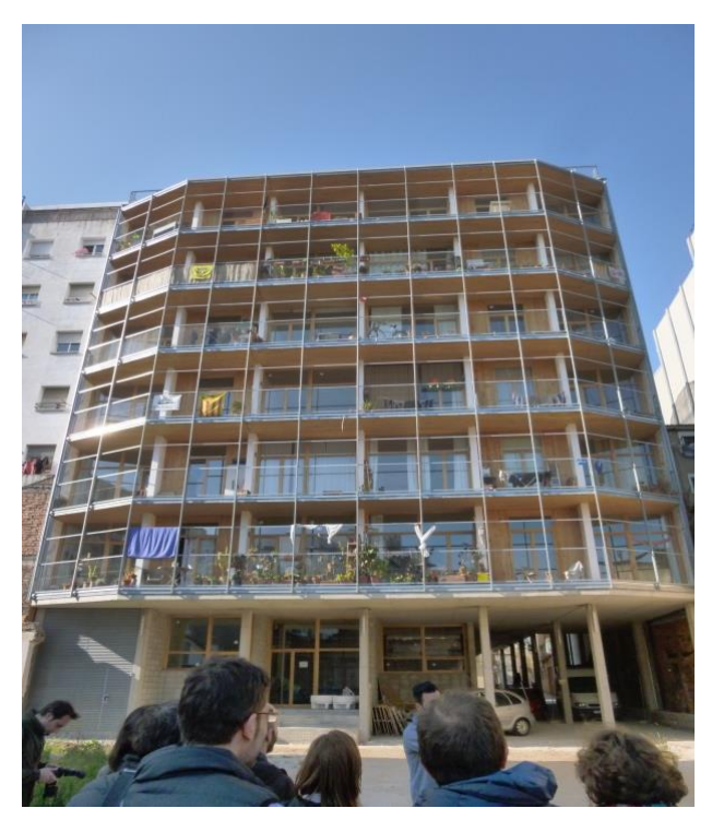
Figure 2: La Borda housing cooperative in 2019: "We build housing to build community" (project slogan). Source: Diego Miralles Buil, March 2019.

In this project, the land remains municipal property, while the cooperative is the owner of the apartments. Thus, this alternative form of housing demonstrates an articulation between public (municipal) ownership of the land and "common management" (community) of the building through a cooperative: a form of "public-cooperative-community agreement" (Miró, 2018). Moreover, as the land was ceded by the City Council, the apartments are assigned according to social criteria: all future inhabitants of the cooperative must be registered in the Barcelona social housing applicants registry. The low-income neighborhood residents who participated in the project produced their own residential solution, which follows the SPH concept, as demonstrated by the SPH Europe Award received by La Borda in 2016 (Urbamonde, 2016). Moreover, due to the internal mode of organization of the group (self-management, self-government, horizontality, etc.), the constitution of this project also refers to the notion of the common (Dardot and Laval, 2014).