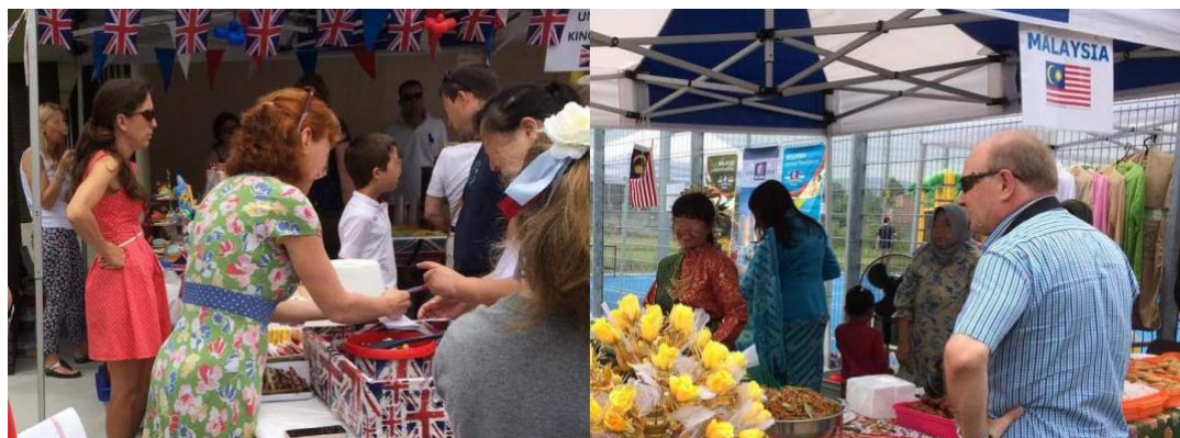
Figure 2: Country stalls on International Day at a school

children are asked to conduct surveys in other classrooms; one of these surveys included questions such as: What is your belief system (religion)? What is/are your nationality/ies? What language(s) do you speak? In how many countries have you lived? What is your favourite dish? What is your favourite season? Such routine exercises enable a school to portray itself as the sum of a highly diverse and unique student body; as such, the school itself embodies a hybrid identity in which nationality, spoken language, and religion tend to be the most regularly thematised categories.