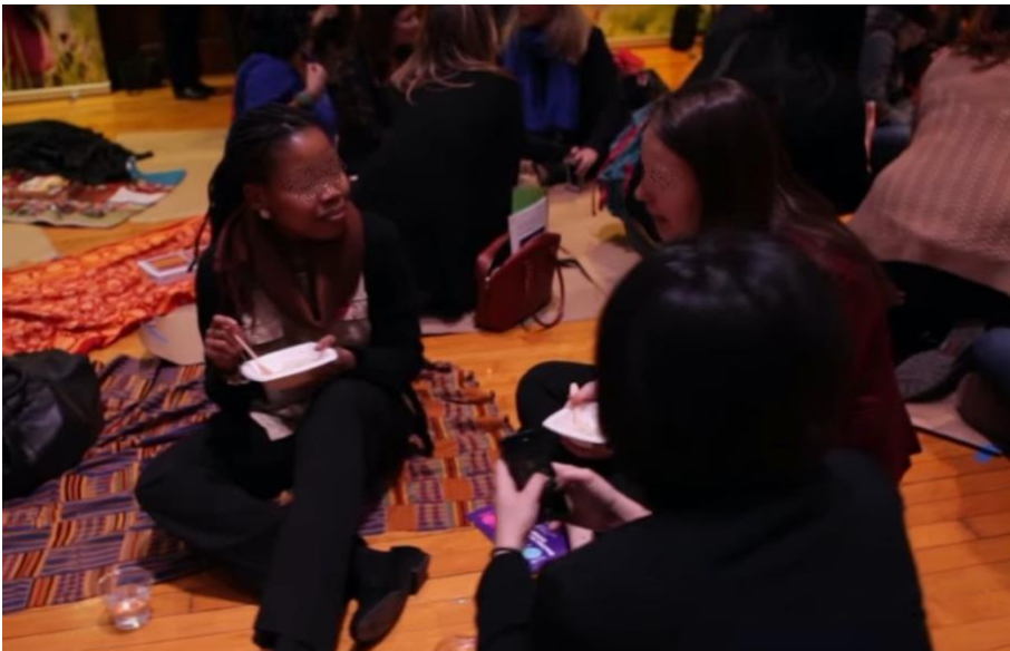
Figure 3: Role-playing “low incomes” at a hunger banquet.

of the world. The story also pointed out the precarious social position of low-range high-income individuals by displacing one high-income character to the medium-income group after being fired. In the discussion that followed, in addition to pointing out the arbitrary nature of privilege, teachers and students discussed the uncertainty of social positions and reiterated the importance of the ability to constantly adapt in a changing world. In other words, while the game promoted a classic cosmopolitan stance in terms of global interdependencies, it also suggested a more pragmatic one by stressing the necessity of being able to handle a global perspective while also successively readapting to social and spatial contexts over the course of one's life.