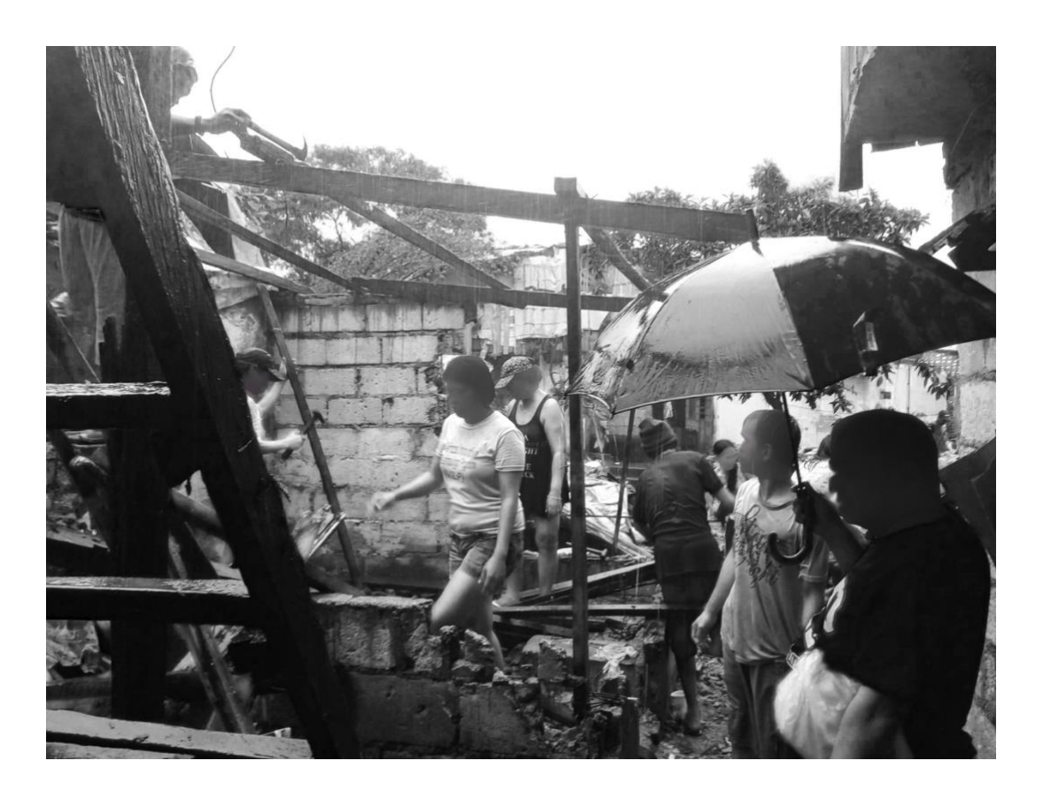
Figure 6 : KADAMAY members help tumbalik a member renter's home in Sitio San Roque, which was forcedfully and illegally demolished without consent, socialized housing, and done during typhoon Rosita (Yuto).

As we can see, as the apparent continuing existence of the Sitio not all residents are involved in instant and lesser-principled trades. Still, in the Sitio, some have unmoved principle of the labor's use of government land to value labor against the Ayalas' rent for private and foreign profit. For the remaining, some are grouped in KADAMAY11, they continue to exist by collectively broadening their ranks. Broadening is pursued through a more democratic struggle of rights claiming, not just the long-time owners of houses but also of the different tenurial statuses of residents, such as sharers and renters. They collectively struggle from repairing houses, which upon recently prohibited by the security guards manned by