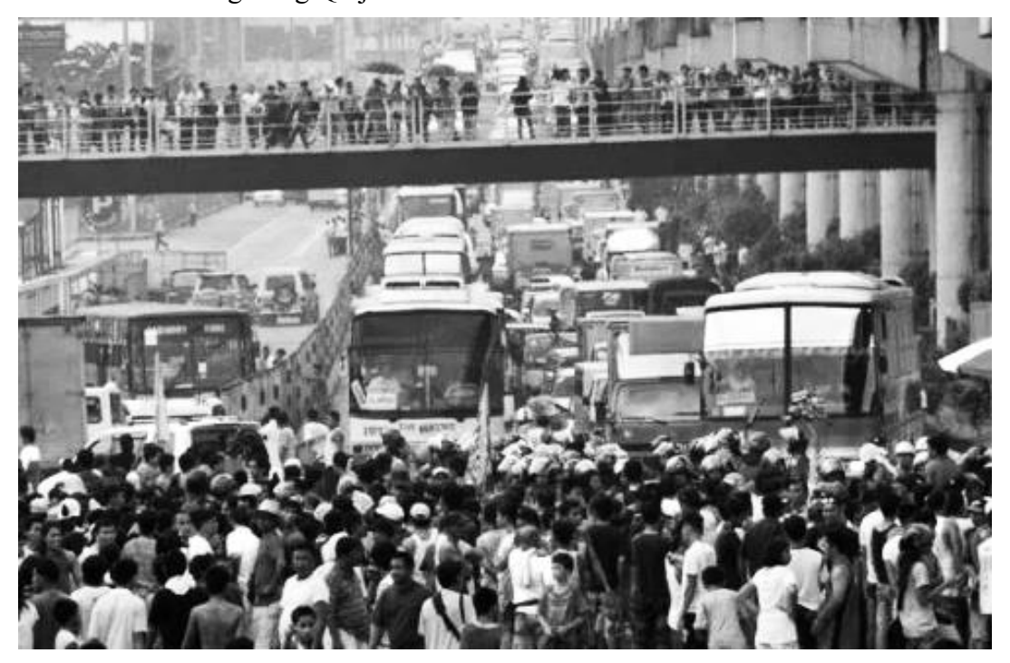
Figure 5 : The barricade of Sitio San Roque residents against the demolition in 2010 led to traffic in the EDSA. Photo is from Manila Times. https://www.manilatimes.net/component/content/article/42-rokstories/26863-quezon-city-squatters-demolition-turns-violent-causes-heavy-traffic