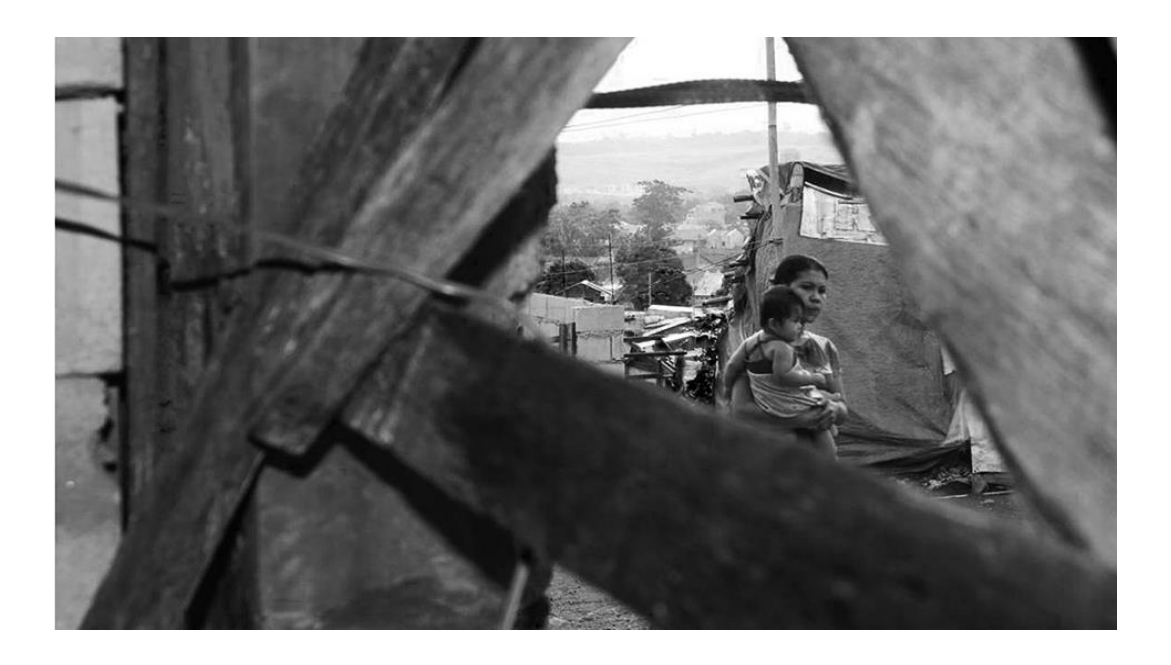
Figure 1 : F(l)itting at the bottom of triangle.

A part of the solution can be sought through city models by locating those who are marginalized in the consensus of knowledge. In doing so and from the celebration of slum agency (M. Davis, 2006), slums will be an indicator in concretizing our understanding of broader social forces that perpetuate poverty in the city and society.