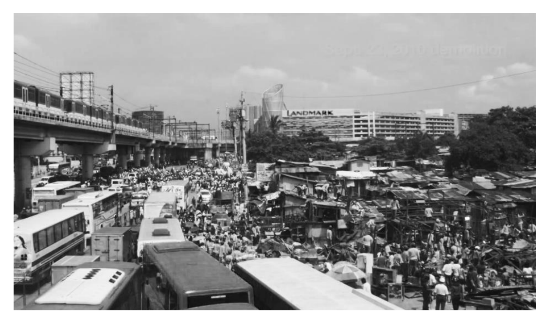
Figure 4 : A 2010 picture of the demolition in the EDSA part of Sitio San Roque.