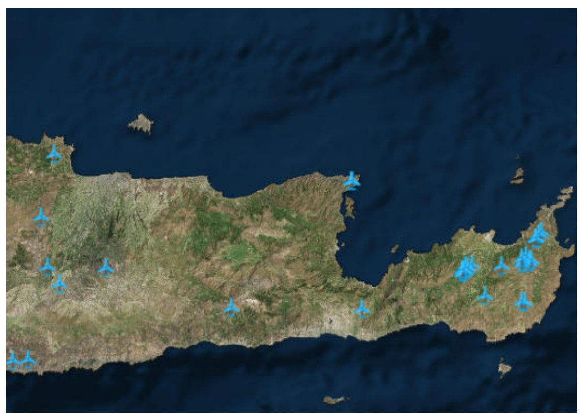
Figure 2: Operating and under construction wind parks in Eastern Crete, 17 May 2017. Scale: 1:1000000.