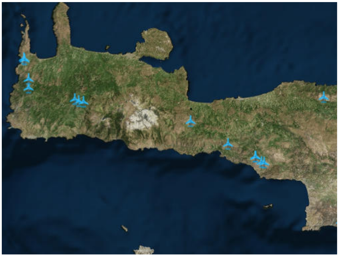
Figure 1 : Operating and under installation wind parks in Western Crete, 17 May 2017, Scale: 1:1000000.