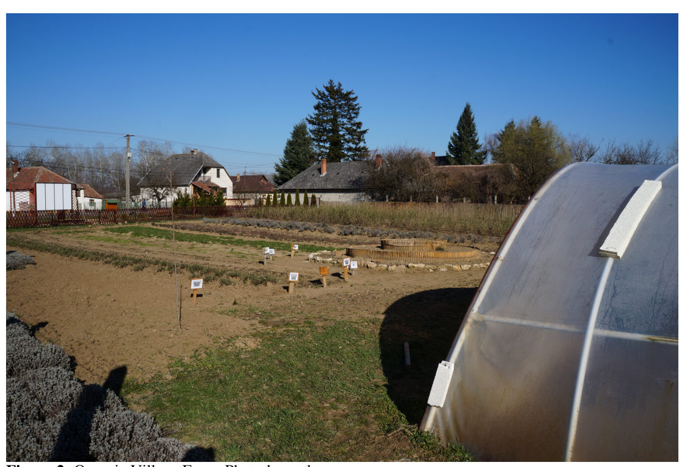
Figure 2: Organic Village Farm.

The Organic Village Farm of Kispatak (case study H1) is a municipality-based initiative. The program began in 2012 with 25 local volunteers and the cultivation of 0.6 ha. plot; by 2015 it had grown to 3.5 ha. and 30 paid employees. EU-based grants (ESF, LEADER) played an important role in the start-up of the farm. From 2012-2014, the production of organic vegetables and fruit was complemented by a village shop (which also functions as a centre for handicraft activities), a food processor financed through a LEADER grant, and an herb processing plant financed through an ESF grant. Since 2010, the municipality of Kispatak has been awarded near 600,000 EUR in EU funding to implement the project (Cebotari and Mihály, 2019).