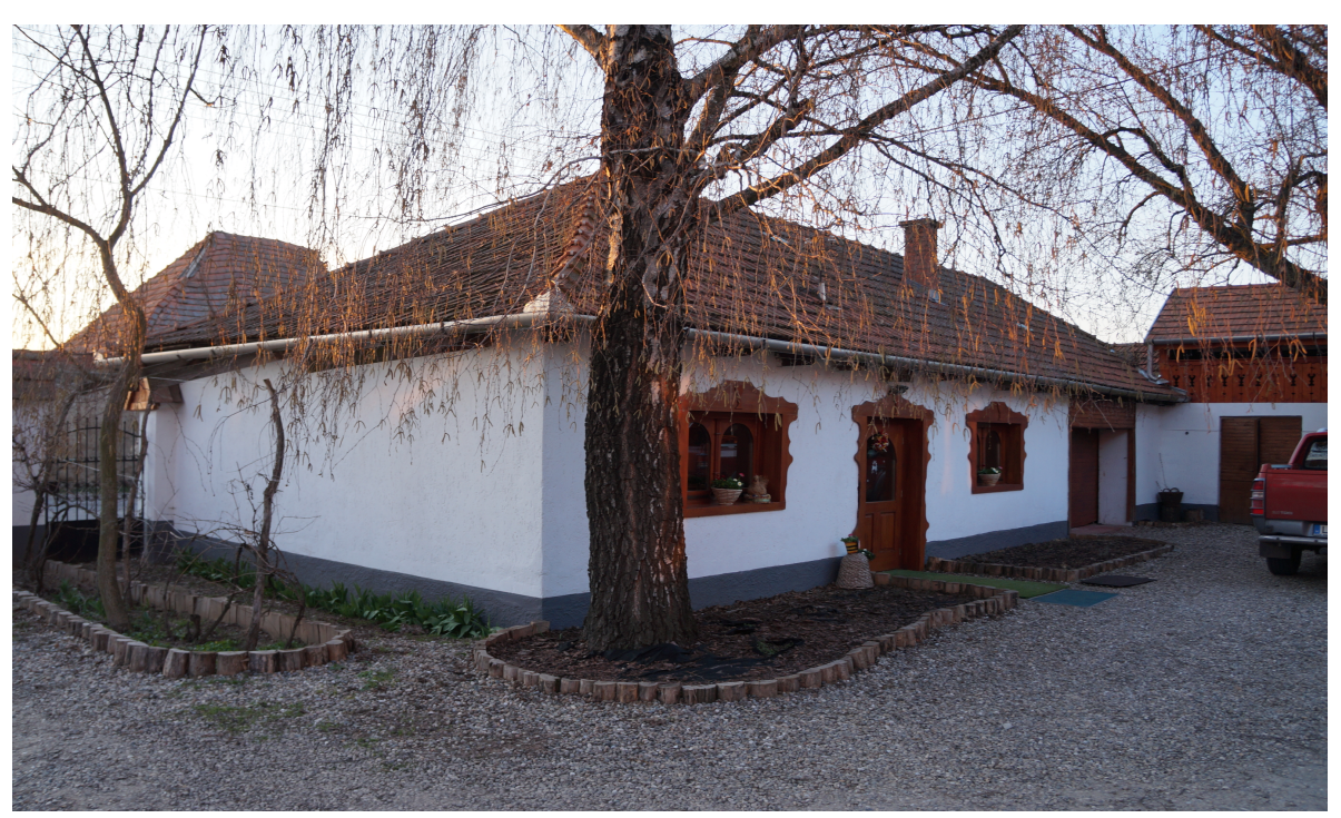
Figure 4: Community Apiculture.

longer. The locals of Albertháza consider the village school of crucial importance to stop further selective out-migration (Interview_H3_I1). The congregation could not prevent the school from closing down in 2008. In order to counteract further selective out-migration from the village the Congregation of Albertháza channeled their income, stemming mainly from international honey sales, into reopening the village school. In 2011, the Congregation was able to reopen the local school as a civilian-based school (through their non-profit Ltd.), but after a year of operation they had financial struggles and handed over the maintenance of the school to the Lutheran Church, as this historic Church had much more funds to cover the fixed costs of the school. The Congregation of Albertháza is unique in Hungary in the sense that they could sustain decision-making power on the local level, even after handing over the maintenance rights to the Lutheran Church. In Hungary, schools maintained by Churches are usually subjected to centralized decision-making and local stakeholders have limited power to influence the governance of these schools. Since the Lutheran Church took-over the school as a maintaining institution, the income from honey production has been spent on excursions, community events, scholarships for local youth and the development of infrastructure for the school and kindergarten.