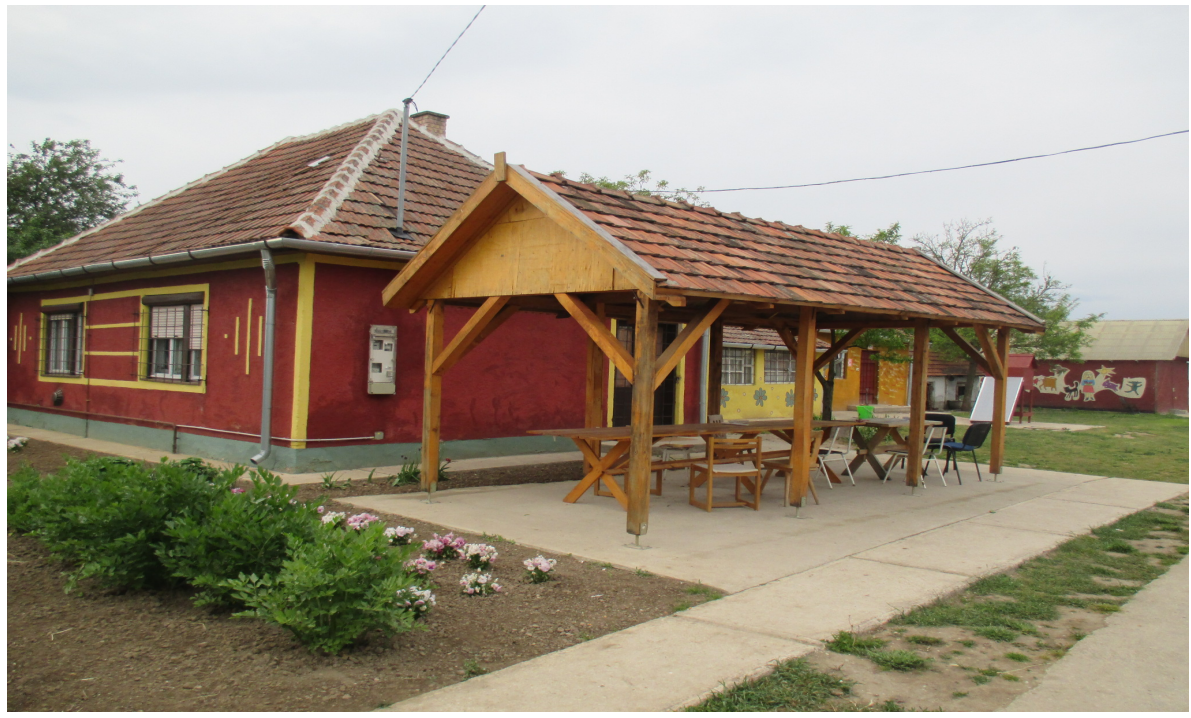
Figure 3: Community center of the Equality Foundation.

through which the integration of the underprivileged, mainly Roma children was aimed at, the Foundation introduced a model local development program in Tarnót in 2009. To capture the multi-dimensional nature of their local development project they labelled it Complex Development. First, the Foundation focused on community building and community development, especially with the parents of children attending the art-based school. Later, they started a sewing program to offer an opportunity for local women to earn an extra income. They manufacture handmade bags and decorations and sell them in the online store of the Foundation. Building on the success of this program and of their long-term presence in the village (six years at that time), the Equality Foundation opened a community garden and a fruit-processing manufacturer in 2016. With the financial support of international foundations, it was able to employ seven people from the village, from the Romungro, Vlach-Roma and non-Roma ethnic groups. This is the only case study, where participative decision-making is used as a way to empower local stakeholders. Decision-making power is concentrated by representatives of the community in the other two cases. In the case of the Congregation of Albertháza, members of the Presbytery make decisions, while in the case of the Organic Village Farm decision-making power is concentrated in the hands of the Mayor (Mihály 2019).