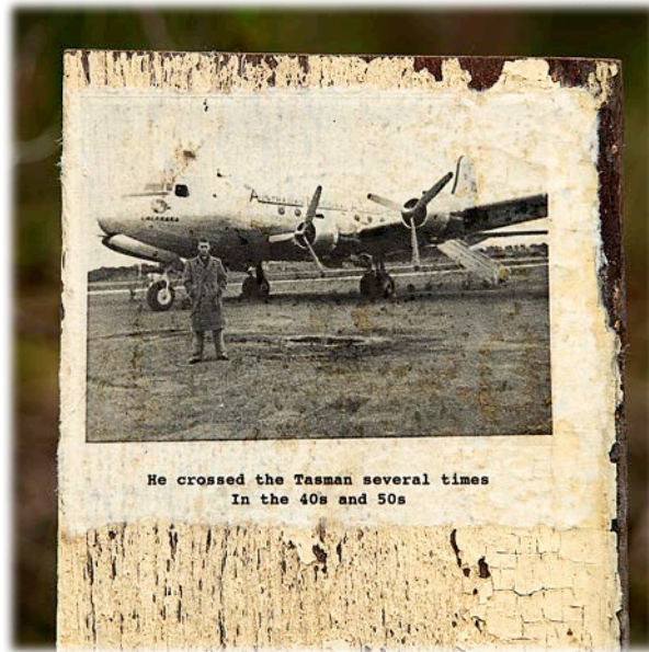
He crossed the Tasman several times In the 40s and 50s And captured images of people and places