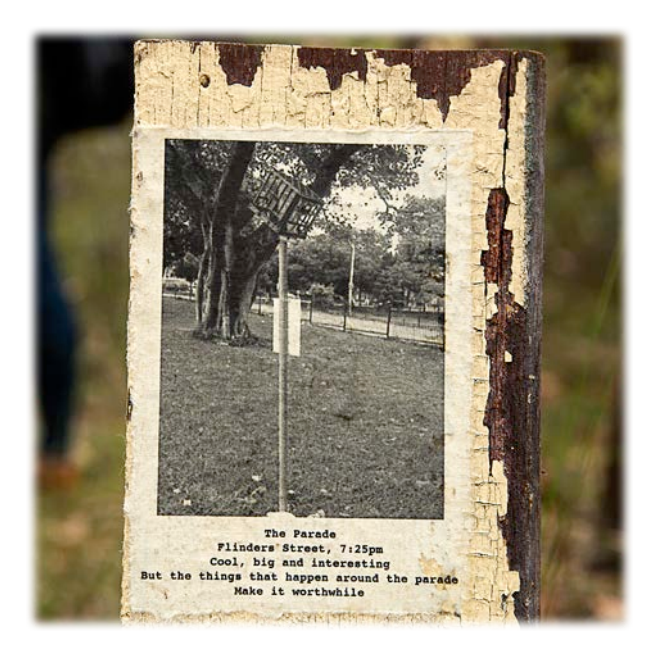
I'm glad I've come It helps maintain a sense of pride in who I am The Parade is cool, big and interesting But it is the things that happen around the parade that make it worthwhile<sup>6</sup>