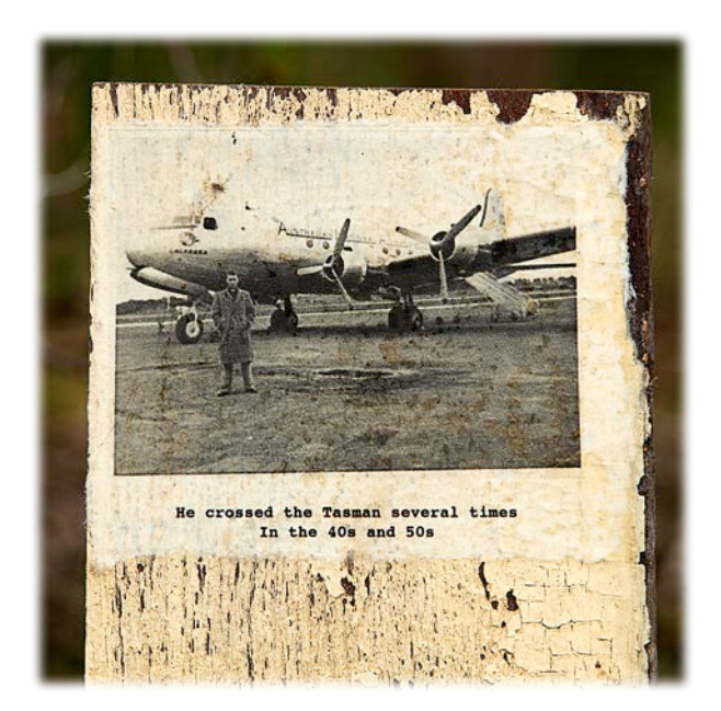
He crossed the Tasman several times In the 40s and 50s And captured images of people and places