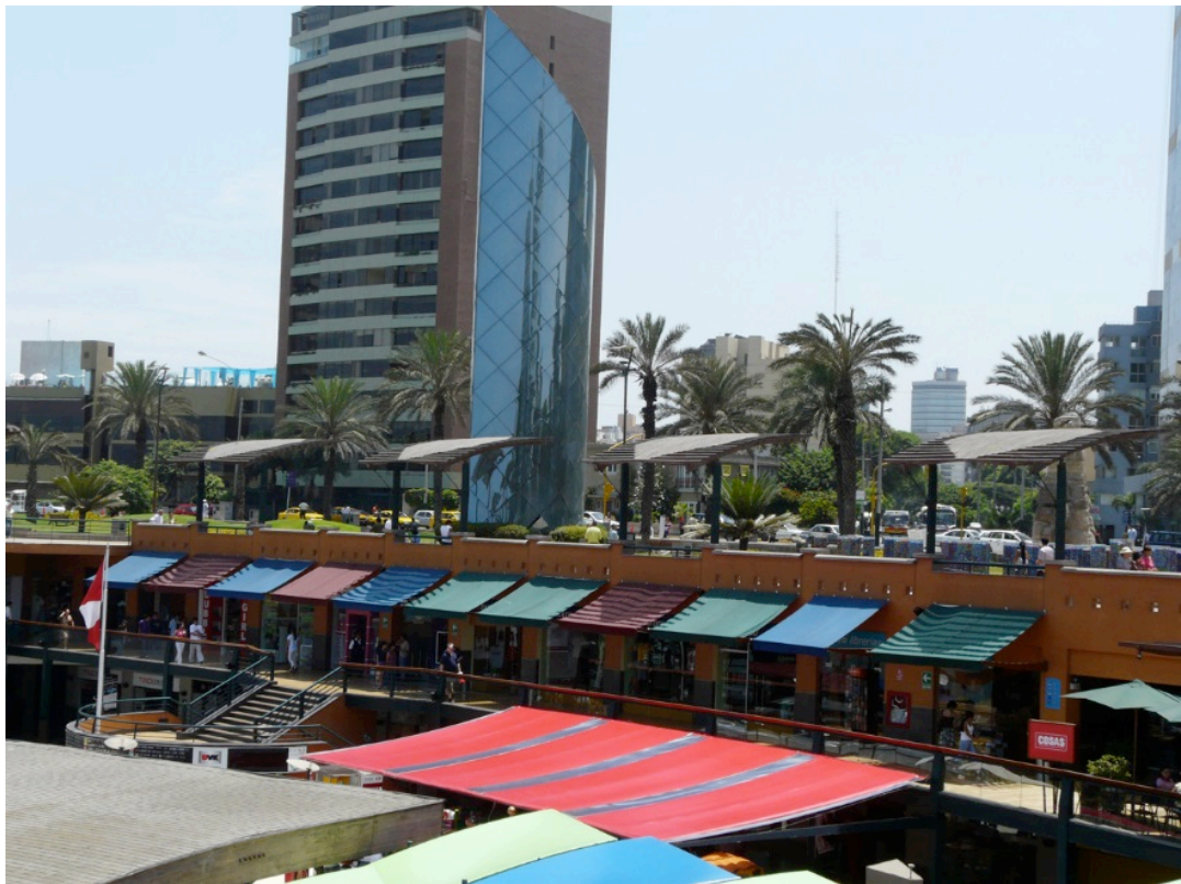
Figure 2. Larcomar shopping centre in Miraflores

Notwithstanding investments in the modernization of affluent areas, for those living in the barriadas and other peripheral neighbourhoods access to public services and a reasonable quality of life still remained a daily problem at the end of the Fujimori administration (Joseph, 2005). According to SASE (2002), only 11% of the settlements regularized by COFOPRI in 2001 had acceptable standards of public services (i.e., water, sanitation, telephone, streets and housing construction material). Parks and recreation areas were progressively privatized, in tandem with restrictions in the access of low-income people to shopping centres (essentially through ‘face-control’ and the exclusion of suspicious mestizos) (Plyushteva, 2009). Urban violence became an ever more serious issue; between 2000 and 2011 the rate of crimes increased by 80% in Lima, while kidnaps increased by 196% and homicides by 233% (according to the Observatory of Criminality of the Attorney General’s office. 5 Instead of isolated problems, those circumstances were associated with the economy’s neoliberalization and deteriorating income levels of Lima’s workforce in Lima between 1987 and 2002, especially among non-unionized, informal workers (Verdera, 2007).