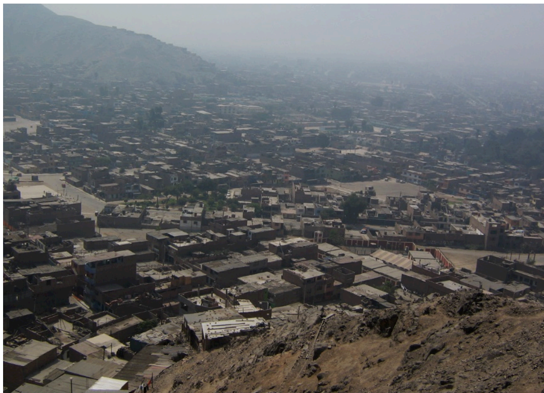
Figure 1. Overview of the periphery of Lima