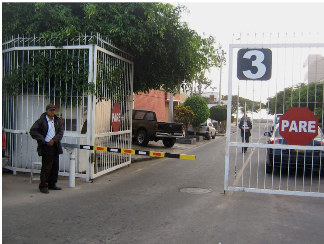
Figure 3. Gated Communities in the municipality of Chorrillos, an increasingly common feature of Lima

After the turbulent political transition that followed the unforeseen resignation of Fujimori (caused by devastating evidence of large-scale and systematic corruption), a new president – US trained economist Alejandro Toledo (2001-2006) – came to office promising to overcome the political and economic shortcomings of the previous governments, which had left the capital fraught with institutional uncertainties, poor policy coordination and deteriorating environmental conditions. In 2006, under Toledo's instructions, the public fund MiVivienda started to finance the purchase, improvement and construction of popular households. Other projects and plans were also launched with the purpose of alleviating the housing deficit (e.g., Techo Propio, Bono Familiar Habitacional). However, the perverse side of those initiatives was over reliance on the private sector for the construction of new housing units, while the state largely withdrew from direct construction interventions. Under free market competition, builders showed a preference for middle class residences instead of less profitable units for the low-income population (interview, national government policy-maker, May 17, 2009). In governance terms, decentralization and democratization only marginally improved in Lima, because national government authorities retained a firm control over decisions and resources (Dietz and Tanaka, 2002).