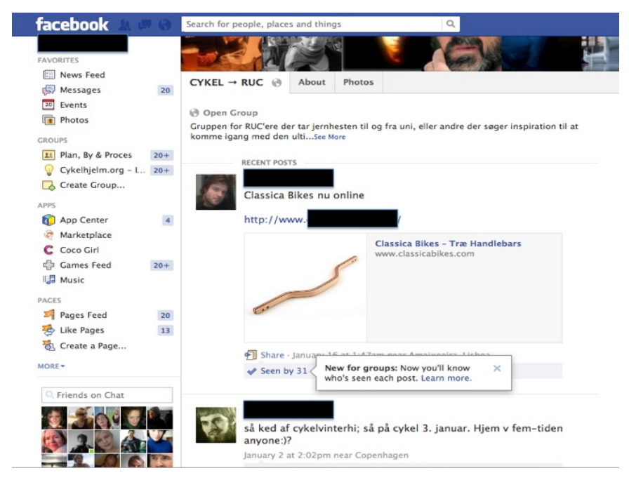
Figure 1: Commuter's post to RUC Cycling Facebook Site.

Bauman might describe this Facebook site as an example of conviviality (Bauman in Thomsen, 2013) rather than community. It could be used to demonstrate Staeheli and Mitchell's (2006) argument that communities are false publics: spaces where sociability is claimed, but ordered and facilitated through security, familiarity, identity, control, and lacking in the randomness, chance, and confrontation with difference that characterizes a true public sphere. In this view, modern communities such as this are another articulation of individualization and separation. I think this is an incomplete understanding. It is true that Roskilde's cycling Facebook community is exclusive, for example in the way it relates to long distance commuters working or studying at Roskilde University. However, its users are quite dissimilar in many regards, ranging from speedy commuters in Lycra on racers, to slow movers on traditional bikes wearing everyday clothes. Moreover, Roskilde University does not have the same kind of websites for car or train commuters, which the majority of staff and students are. A strong cycling 'we' is created through this site, because it serves a minority mobility group at the university, enabling their face-to-face contacts and friendships, as well as nurturing a sense of belonging to a new movement (compare with Aldred's (2013) discussion of English cycling blogs, which are used primarily to complain about poor cycling infrastructure).