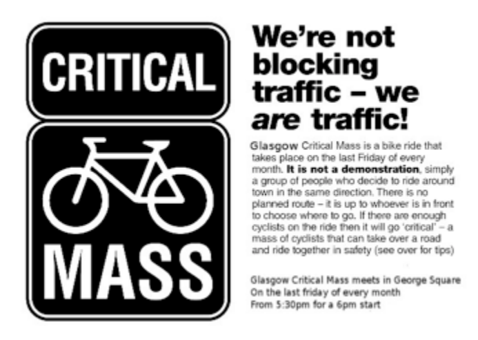
Figure 4: Glasgow Critical Mass advertisement