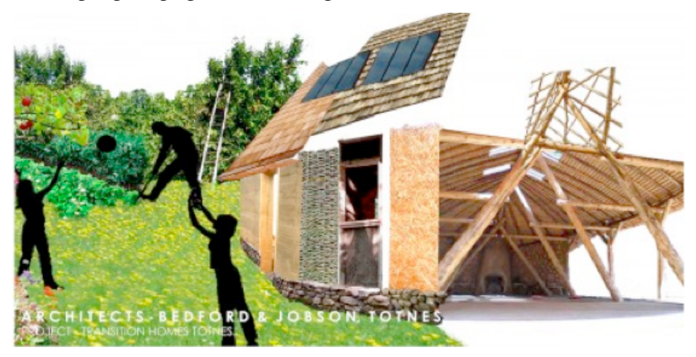
Figure 3. Image developed for Transition Homes' first site

intensive work, TH's first site Clay Park, in Dartington Parish, near Totnes, will feature 25 homes, a community hub building and allotments on 6.83 acres. The tree planting carried out to celebrate the site purchase, was led by the Chair of the Parish Council and watched by members of neighbouring Town and District Councils, highlighting again a brokering between 'first' and 'second cut' civics.