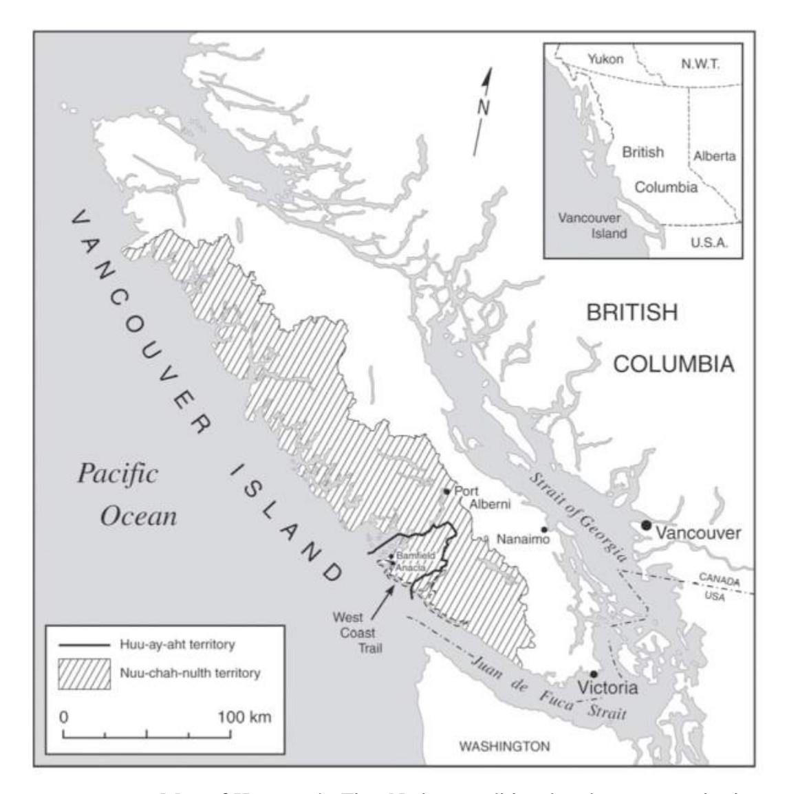
Figure Two: Map of Huu-ay-aht First Nations traditional and reserve territories (Castleden, 2007).