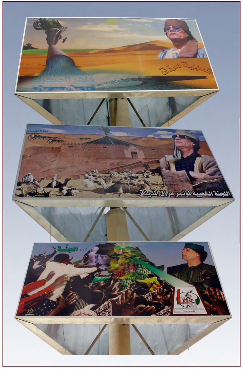
Figure 2: Gaddafi's billboards in Murzuq, 2004.

the Gaddafi regime (Bessis, 1986, 184-89). Taking this perspective, not only is Libya's significant black population – that can be noticed in the oases – connected with the ancient history of black Africans' slavery in Libya, but it also reveals a particular social reconfiguration that occurred within the Gaddafi's political project (mainly in the 1990s) bringing a significant number of black people to Libya to work principally in the gardens in the southern oases, in construction sites, and in garages. Black migrants were described, at the same time, as an important component of the Libya's oases identity, which Gaddafi took as mainstay of the Libyan national identity.