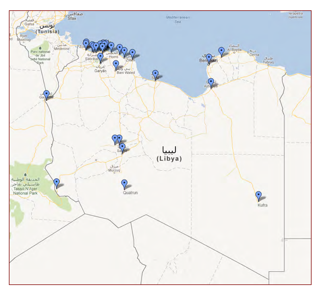
Figure 3: Migrants detention centres in Libya, 2007.

Yet, by comparing the messages in Gaddafi's billboards with the map of migrants detention centres in Libya, that can be accessed from the Fortress Europe website,<sup>5</sup> what clearly emerges is the paradoxical nature of Gaddafi's political project, deriving from the fact that Gaddafi's identity discourse was characterized by important gaps between what he used to say and what actually did on the ground. In fact, at Quatrun (close to Murzuq), at Kufra, and in the other major Libyan oases (Ghadames, Ghat, Sebha,...) government-run migrants detention centres have been built since the beginning of the 21<sup>th</sup> century, transforming Libyan oases in the Sahara from an "open frontier" into "gated border sites."