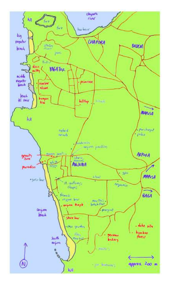
Sketch 1. The village of Anjuna.

certain behaviours and physical and cultural conditions. When bodies become sticky, they collectively acquire surface tension and become relatively impenetrable by other bodies (a situation usually called segregation in the geographical literature). Everyone has had the feeling of being 'out of place' because of the dense presence of many other bodies, other especially in terms of physical form. In Anjuna, viscosity comes about to a large extent because its kind of tourism, though centered on music and drugs, requires visuality to be pleasurable. Let it be clear from the outset that I am interested in viscosity from the point of view of the Western tourists, and specifically, the Goa freaks. I am interested in what happens to white bodies seeking pleasure and enlightenment in a third world village, not whether they are welcomed or not by the locals. The basic argument is therefore that psychedelic transformations of self cannot be separated from a visual economy in which differentials between bodies lead to their spatial and temporal distribution.